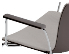
Armrests CV - pad (only for PO)