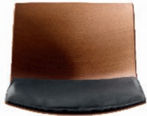
Cushion Art. 0230