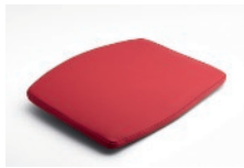
Cushion Art. 0231