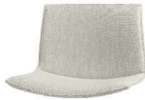
Removable cover Art. 3116