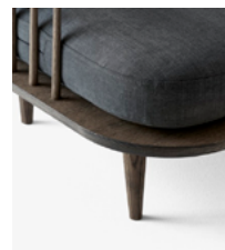
→ Smoked Oiled Oak w. Hot Madison 093