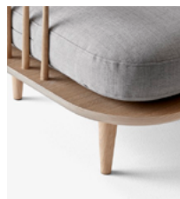
→ Oiled Oak w. Hot Madison 094