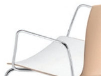
Armrests BV brushed stainless steel