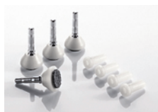
Set of glides Art. 2015