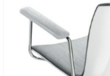
Armrests CV - pad (only for PO)