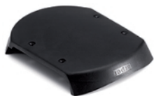
Stacking protection pad with link Art. 0260