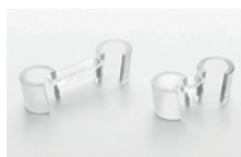
Movable link Art. 2073