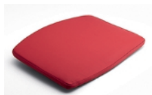
Cushion Art. 0261