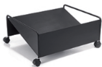
Trolley Art. 0760