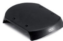
Stacking protection pad Art. 0262